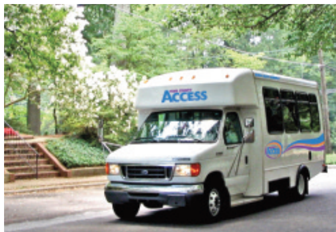
City of Rock Hill Monthly Passenger Trips

York County Access – a demand response transportation service frequently referred to as “dial-a-ride,” has been operating in the Rock Hill Area for six months now and has achieved some very good results. Since completing its first full month of operation last September, York County Access has seen demand for its service rise approximately 368% – based on the total number of passenger trips taken per month!